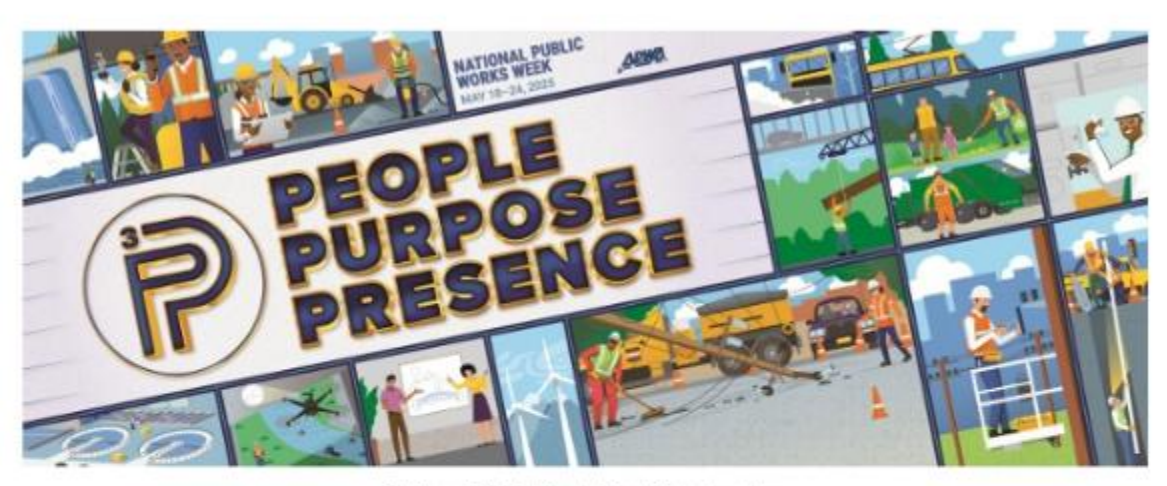
National Public Works Week Proclamation